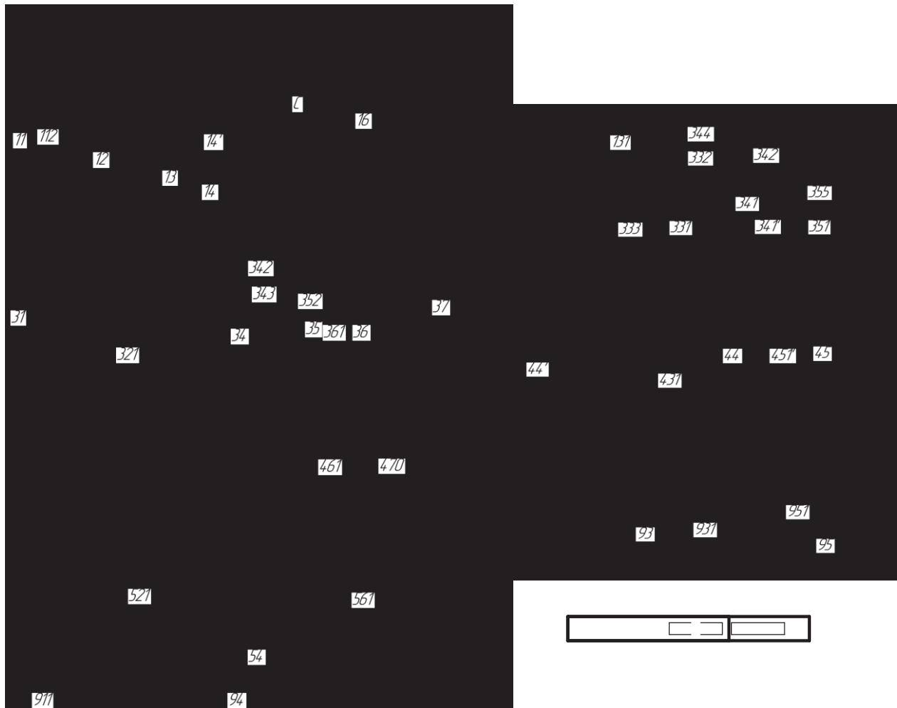
FIGURE 2. Jacket construction schema

The design of the product was developed using computational and graphic method. The properties of materials were considered when designing different stretchability of the upper materials, their different thicknesses, and densities. A schema of the structure is shown in Figure 2. The parts made of elastic supplex are shown as shaded (sample #2).